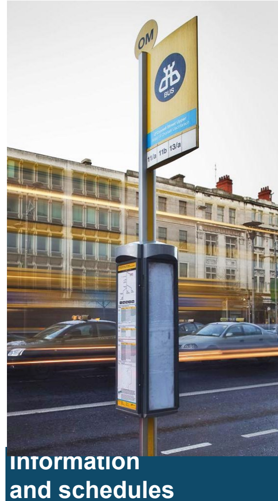
Information and schedules